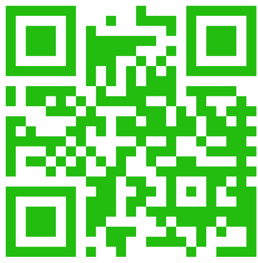
Clark Mills PTO Website