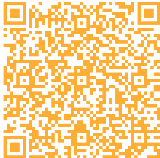
2023-2024 District Calendar

DIRECTIONS: Open the camera app on your smart phone. Hold your phone so that the QR code appears in view. Tap the notification to open the link associated with the QR code.