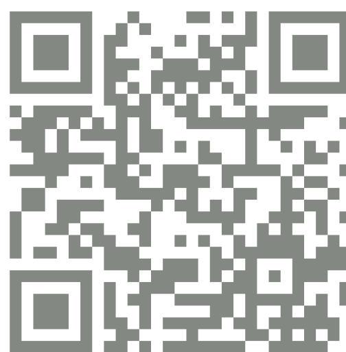
CM's District Website