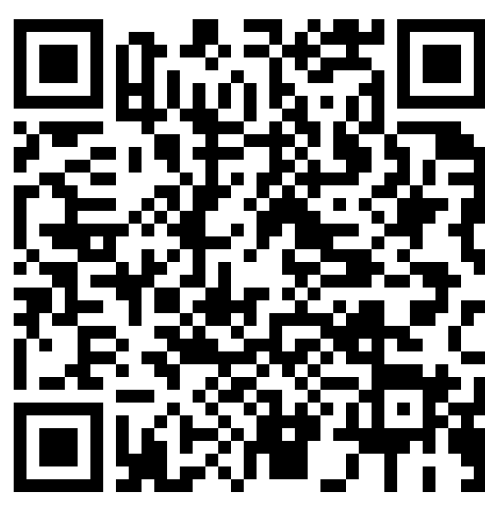
2023-2024 PTO Calendar